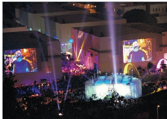
LA Center Studios Special Events