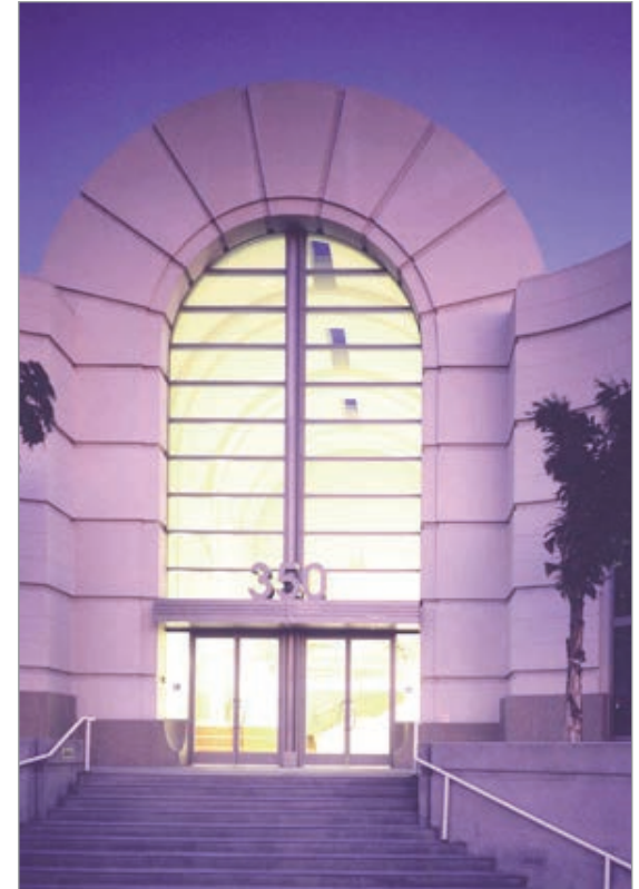
Los Angeles Area Chamber of Commerce