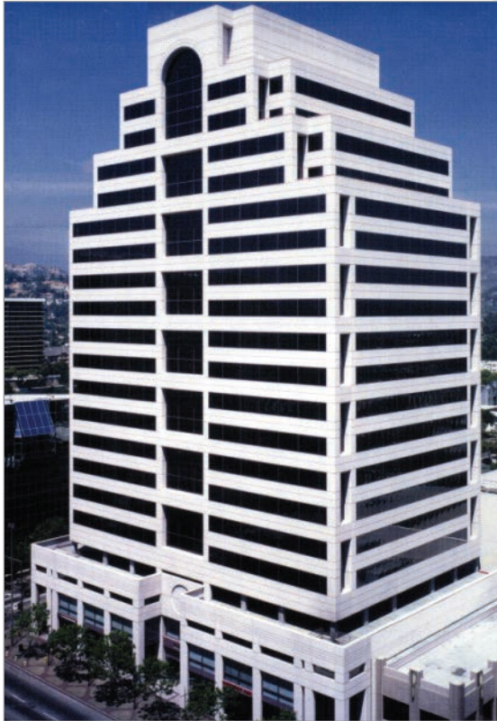
550 North Brand