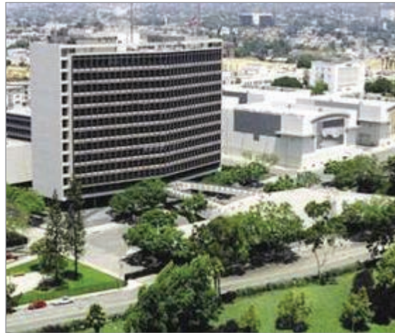
Los Angeles Center Studios