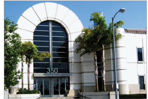
Los Angeles Area Chamber of Commerce