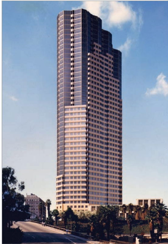
One Los Angeles Center