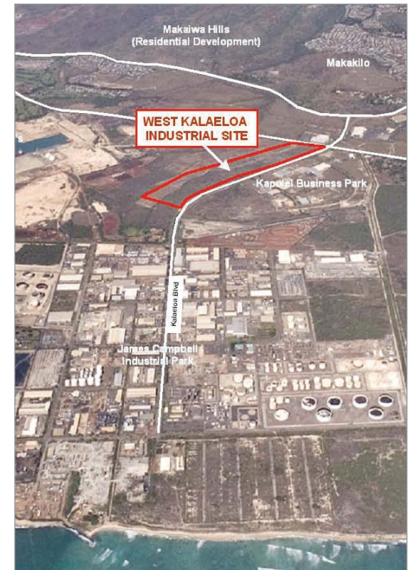
West Kalealoe Business Park