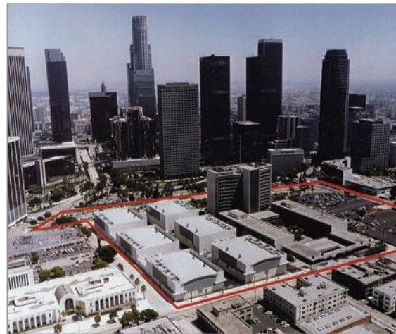
Los Angeles Center Studios