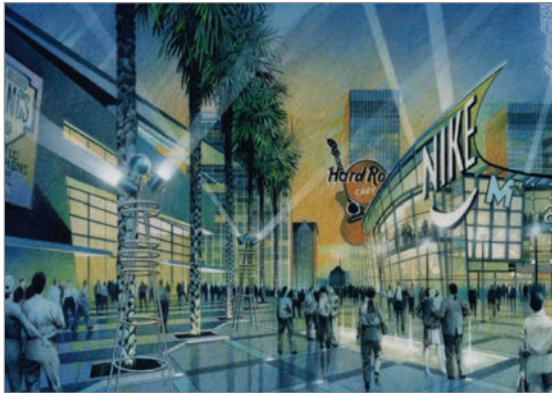
Downtown Arena Project